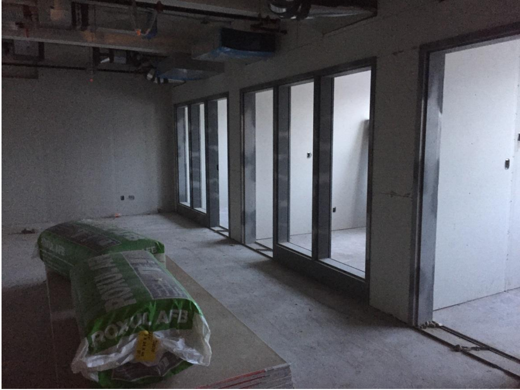
Some office space in the Town of Fort Macleod area has been boarded