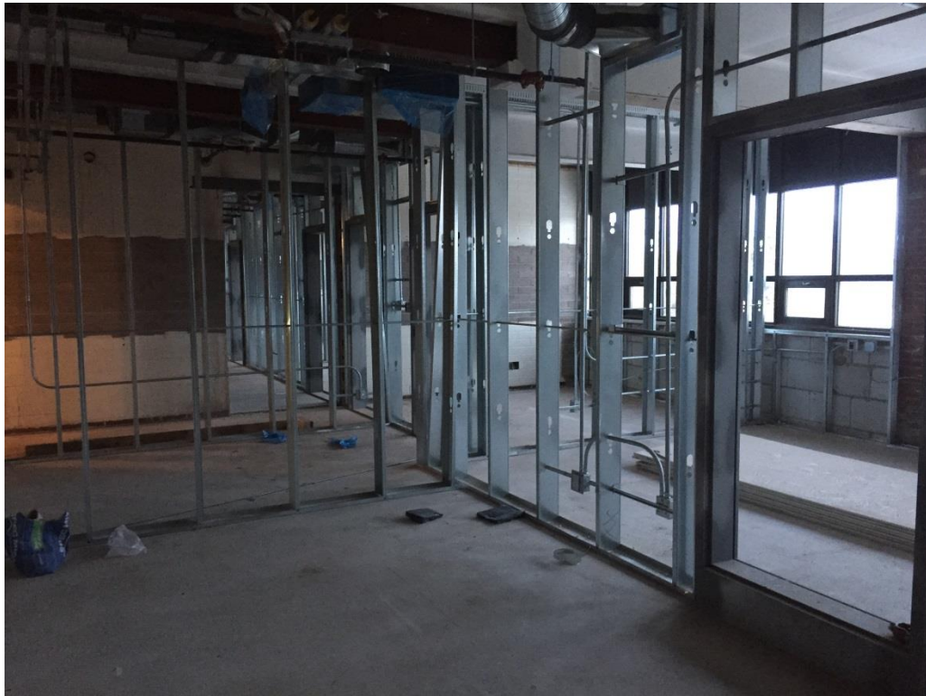
Example of the framing of office space upstairs in the School Division area