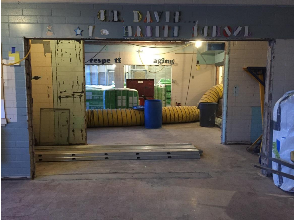
View of the original office opened up for joint reception area