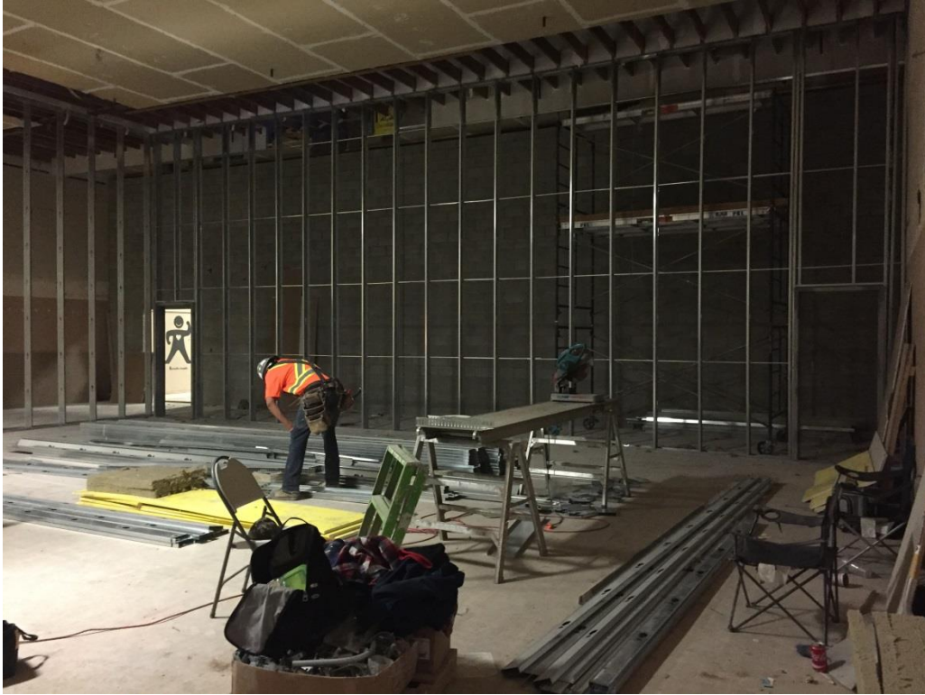
New masonry wall and framing in the future Council/Board room