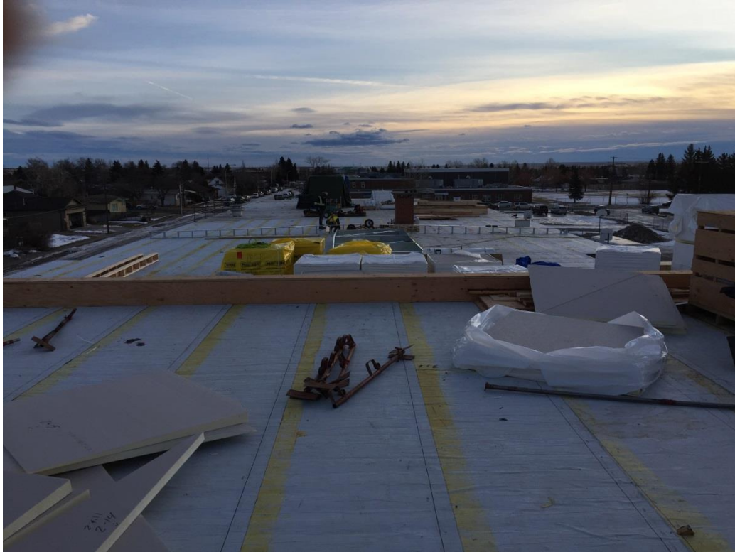
Replacement roofing underway